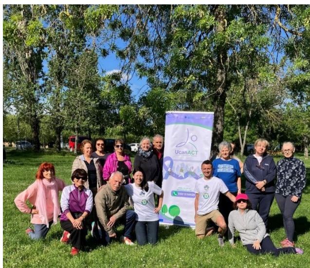
Visuals 3 – 4: Some of AIFI informational items.