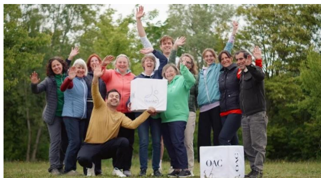
Visuals 1 - 2: Some of OAC informational items.