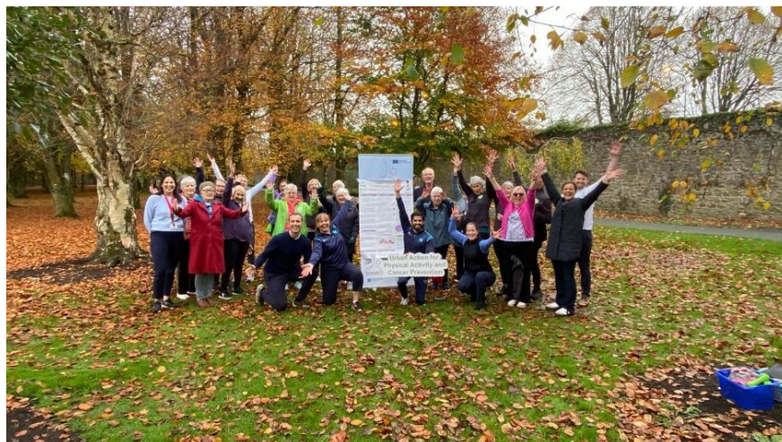
Visuals 5 – 6: Some of Kilkenny County Council informational items